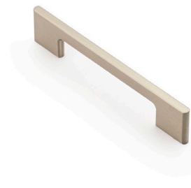
Dull Brushed Nickel